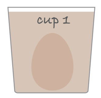
Fill one with dark soda and label it "Cup 1"